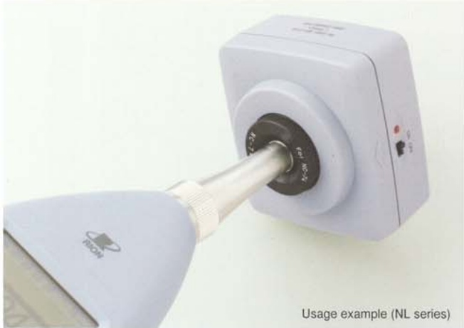
Usage example (NL series)

Carefully insert the microphone all the way into the coupler of the NC-74. Then simply turn the power on to apply a constant sound pressure level to the diaphragm of the microphone.